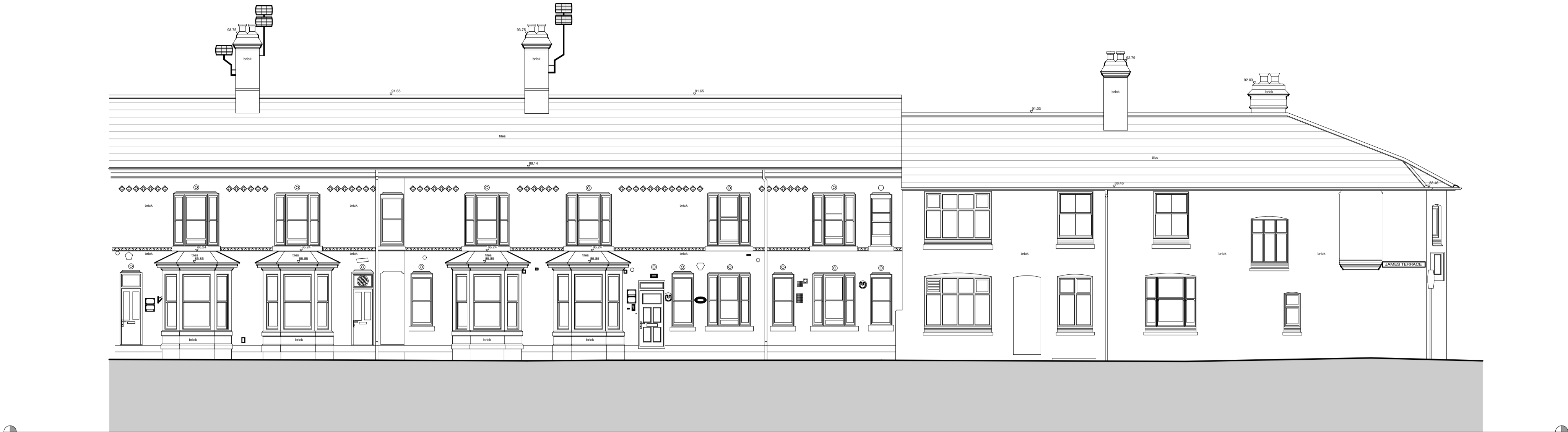
1. Existing Front Elevation 1 Scale: 1:100