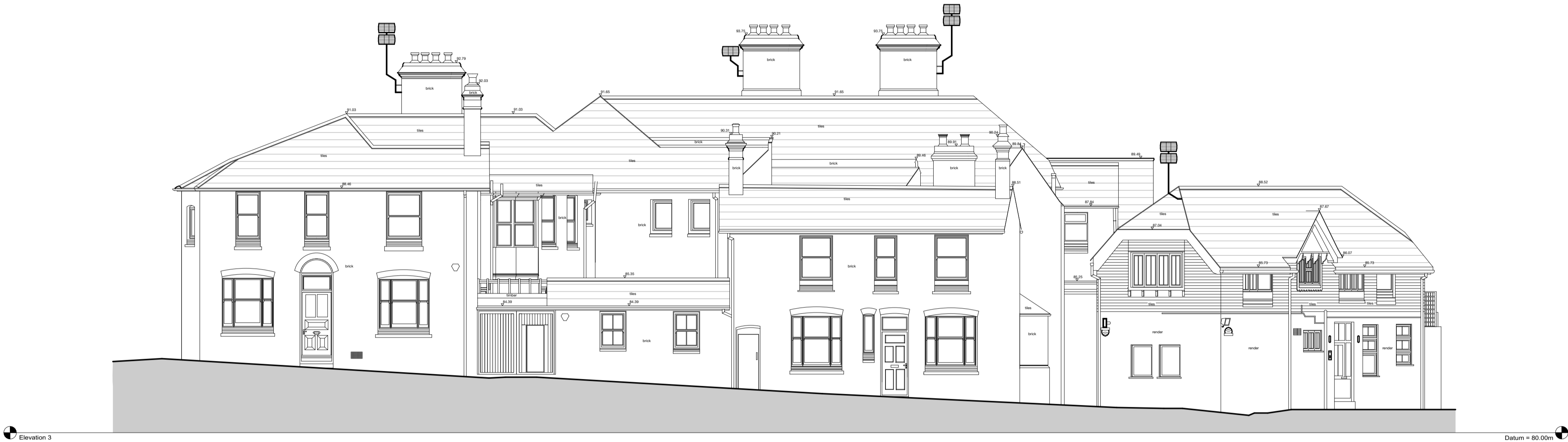
2. Existing Front Elevation 2 Scale: 1:100