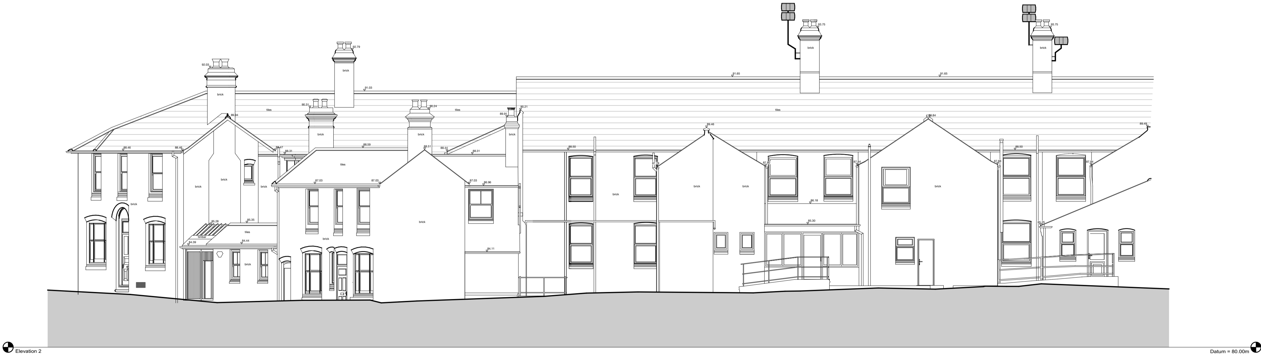
3. Existing Rear Elevation Scale: 1:100